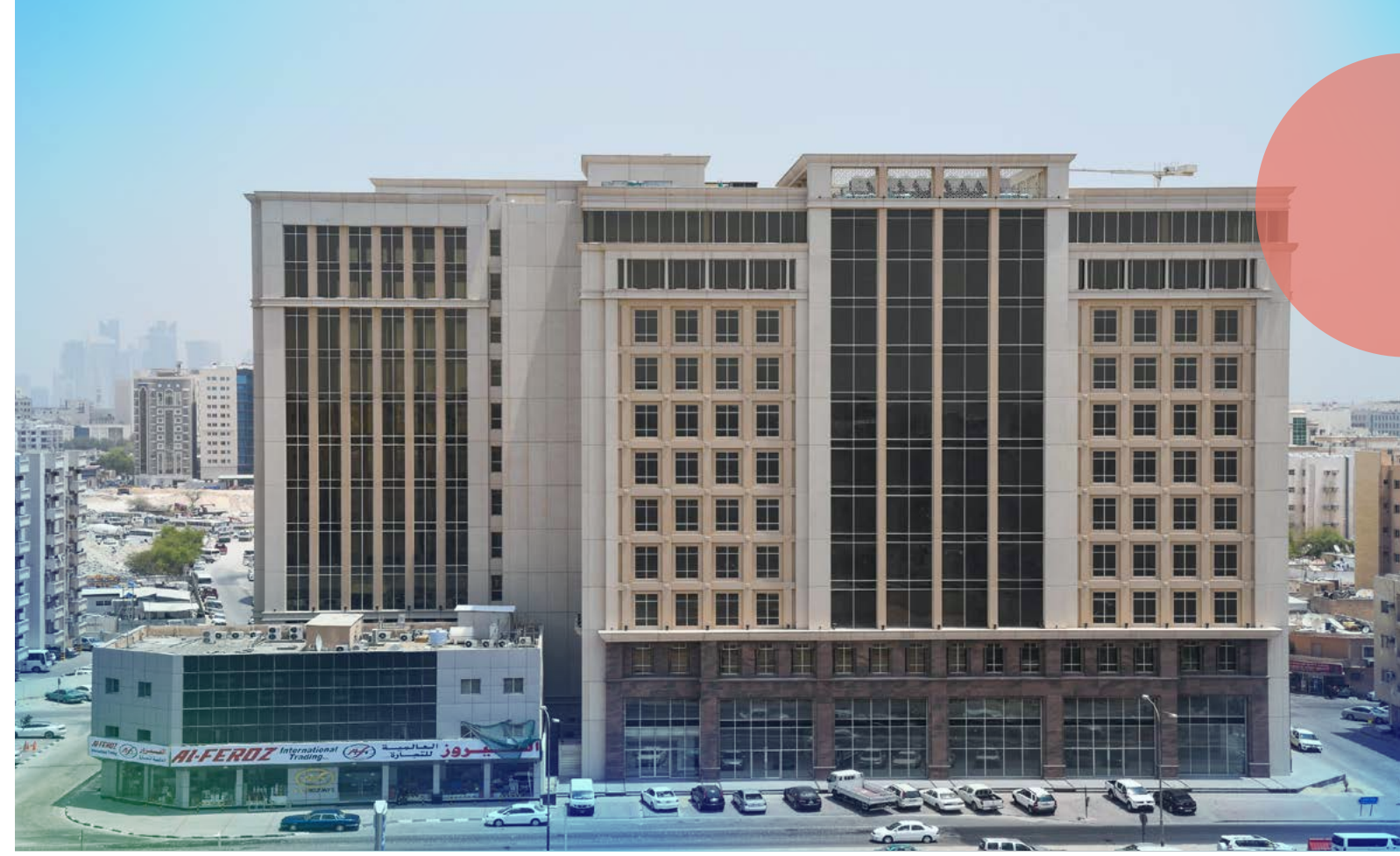
Technip Energies office in Doha, Qatar