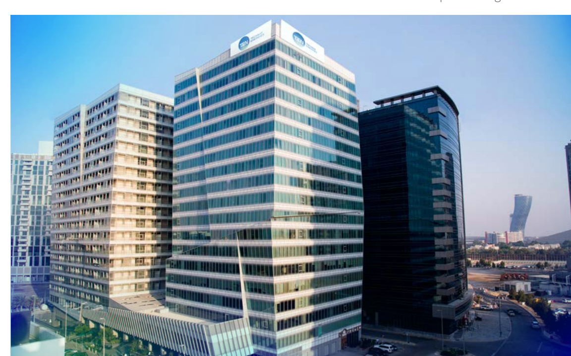
Technip Energies office in Abu Dhabi, United Arab Emirates

Technip Energies has an extensive history in Saudi Arabia, a key country and market where we are a leading player in onshore, offshore and loading systems. We have operated continuously in the country since the mid-1970s. We supply proprietary technologies to the market as well as expertise in the design and construction of state-of the-art processing facilities.