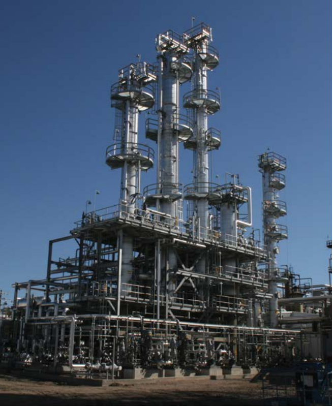
Badger BenzOUT technology at Wyoming Refining Company's (a Par Pacific company) refinery in Newcastle, Wyoming

...technology leverages our long experience in ethylbenzene and cumene technologies"