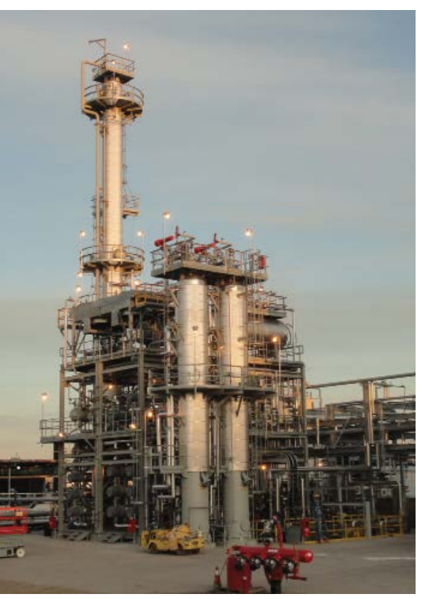
Badger BenzOUT technology at Husky Energy's refinery in Superior, Wisconsin.

Our benzene reduction technology can help you meet benzene regulations, increase octane and improve your refinery economics.