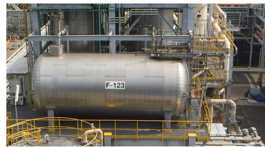
Pure.rBrine™ by T.EN section, ABT, Map Ta Phut, Thailand