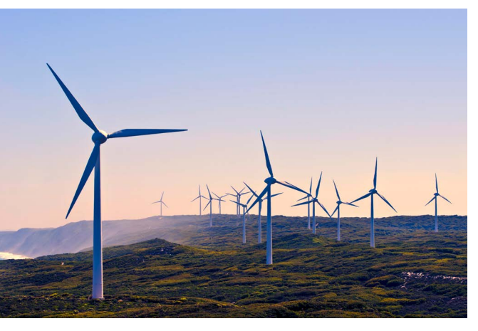
Epoxy resin end product