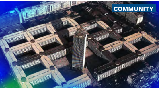
Jussieu University Campus Rehabilitation Paris, France S,E,CS,PM