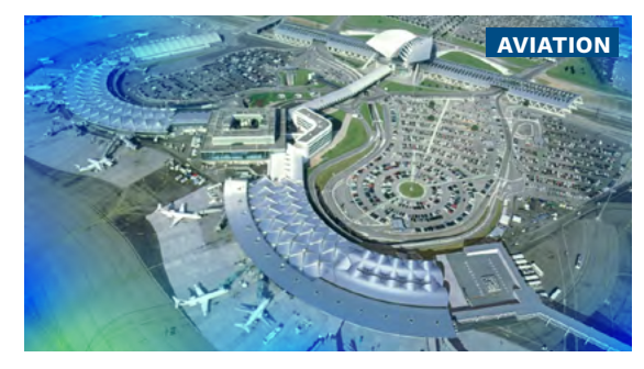
Saint-Exupery Airport Terminal 2 Exp'n Lyon, France E + PM