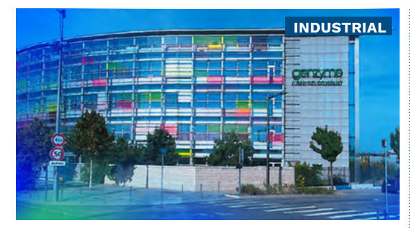
Sanofi Industrial platform for production of immunotherapy products Lyon, France EPCm