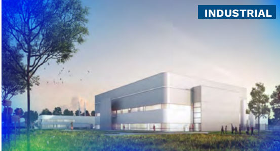
BIAH production site of viral animal antigens Lyon, France CD + EPCm