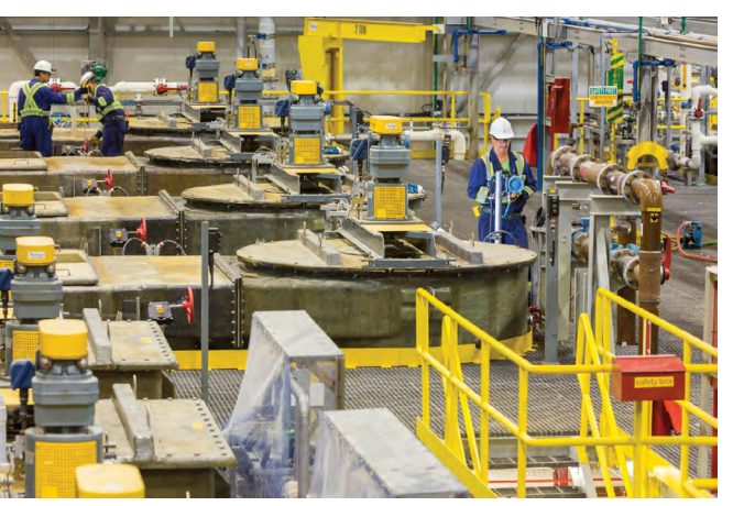
Uranium SX Plant, Canada

Our ongoing R&D program, including CFD simulations, 3D Model design, and pilot plant testing, allow us to support and improve the equipment design and process guarantees. For example, the new conical pump has resulted in a 40% reduction in organic entrainments compared to the former design.